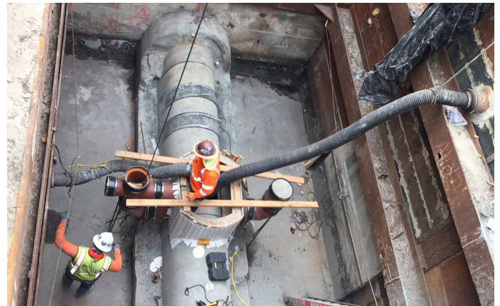
North Outfall Sewer Rehabilitation

Steady increases in Sewer Service Charge rates were paused in 2020 because of the pandemic. Gradual rate increases beginning in Fall 2024 are critically needed for LA to invest in infrastructure projects that protect public health and the environment.